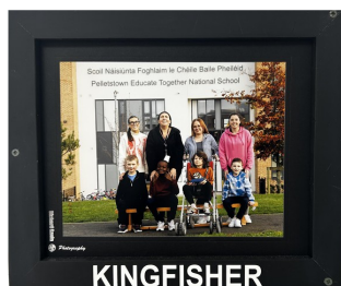
Kingfisher - Senior Class