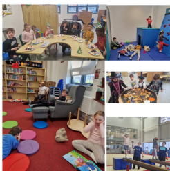
Cruidín - Junior Class