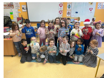
Junior Infants - Wren